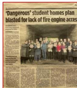
Our VOICES have been HEARD!

I am also pleased to say that the proposed 38 student accommodation at Richmond Terrace, which would negatively impact residents and access, has been WITHDRAWN.